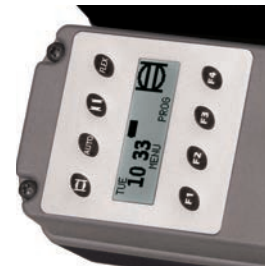
Built-in quartz-controlled timer with LCD display