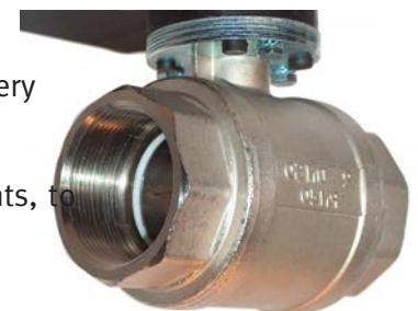
Brass, nickel plated valve

JORC is NEN - EN - ISO 9001:2015 certified