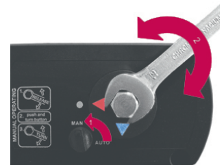
Manual valve opening and closing possible, in case of a power failure

Manual override Yes Remote controllable Yes (optional)