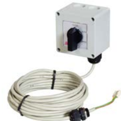
Remote control option