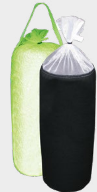
Highly recognizable JORC performance elements