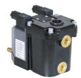
Three inlets offering installation flexibility

Integrated mesh strainer; protects the valve against large contaminants