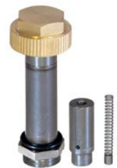
JORC's direct acting valve assembly, offering you reliability