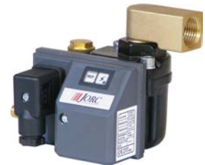
Side inlet adapter optionally available