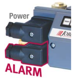
Power ALARM Alarm feature (potential free relay)