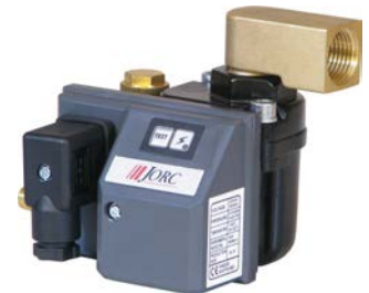
Side inlet adapter optionally available