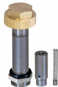
JORC's direct acting valve assembly, offering you reliability