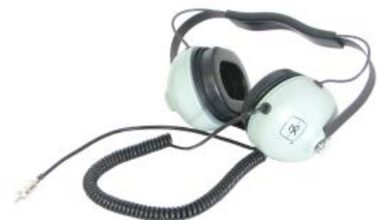
Hard-hat headset optionally available

JORC is NEN - EN - ISO 9001:2015 certified