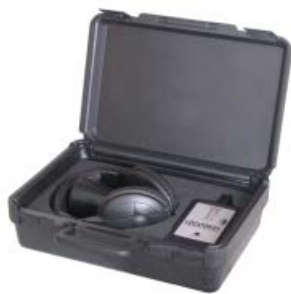
Supplied in a protective case, complete with headset and focusing probe