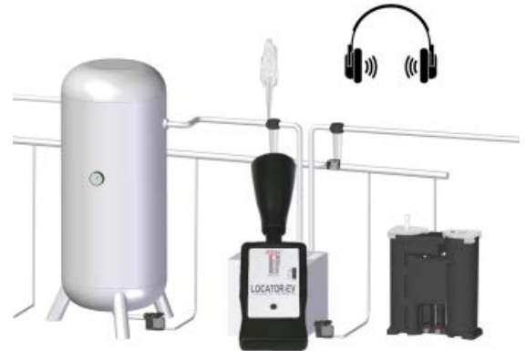
Visual and audible leak indication