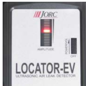
Visual and audible leak detection