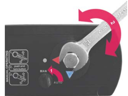
Manual valve opening and closing possible, in case of a power failure