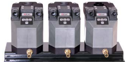
Three stage compressor applications can be fitted with the all-in-one solution, covering the various pressure ranges - mounted on one bracket