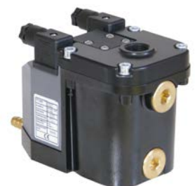
Multiple inlet options