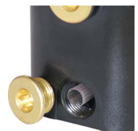
Integrated mesh strainer protects the valve against large contaminants

*A1 = Normally open contacts, closed when in alarm phase. LED on the drain is OFF when in operation and ON when in alarm mode. A2 = Normally closed contacts, open when in alarm phase. LED on the drain is ON when in operation and OFF when in alarm mode.